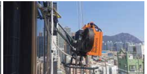
Water leaking test @The Grands