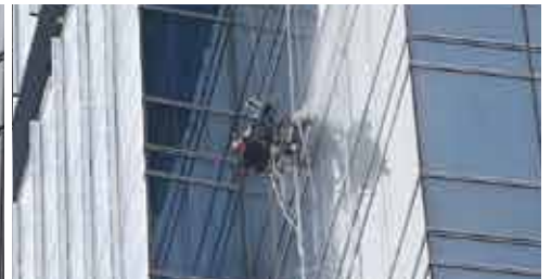
Water leaking test @King Yip Street