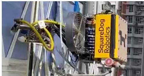
Water leaking test @Grand Victoria