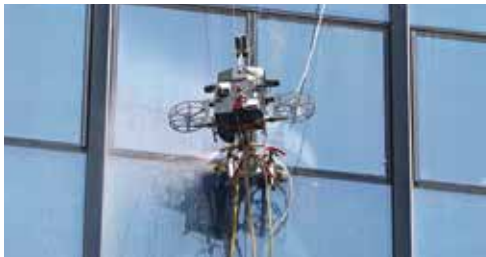
Water leaking test @Taikoo Place IIB