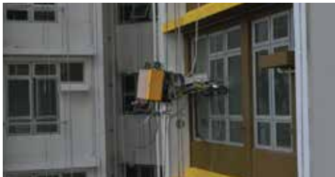
Water leaking test @Ching Fu Court