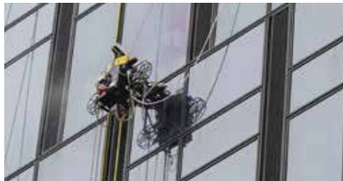
Water leaking test @11 Skies, Skycity